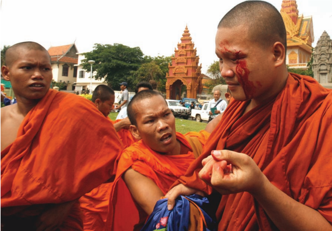
Counter-demonstrators physically attacked Khmer Krom protesters on April 20, 2007 in front of Phnom Penh's Ounalom Pagoda.

On April 20, 2007, police forcefully dispersed another demonstration by around 50 Khmer Krom monks at the Vietnamese and US embassies in Phnom Penh. 187 Later that night one of the monks who had joined in the march was badly beaten by a group of unknown men after returning to his pagoda. 188