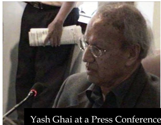
Yash Ghai at a Press Conference on 10 December 2007

Yash Ghai is far from alone in this assessment. The US State Department also concluded that the Cambodian government's human rights record remained poor in 2007, noting that "security forces committed extrajudicial killings and acted with impunity" and that "there was little political will to address the failure by government authorities to adhere to the rule of law." 4