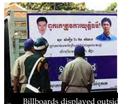
Billboards displayed outside the donor meeting on June 19