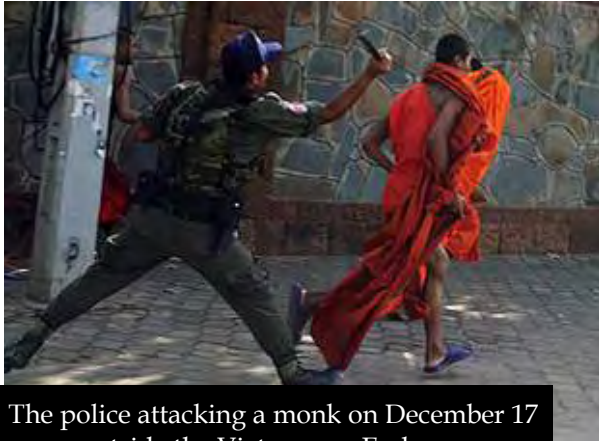
The police attacking a monk on December 17 outside the Vietnamese Embassy