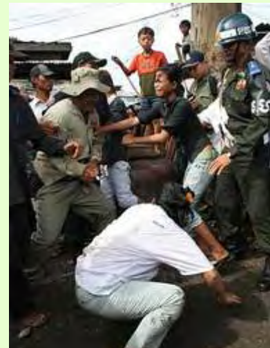
Villagers fighting with police as they try to protect their homes

On July 3, five representatives were charged with property destruction. The charges were based on a criminal complaint filed by 7NG, and relate to the events of June 26-30, when a fence erected by the company was supposedly damaged by villagers.